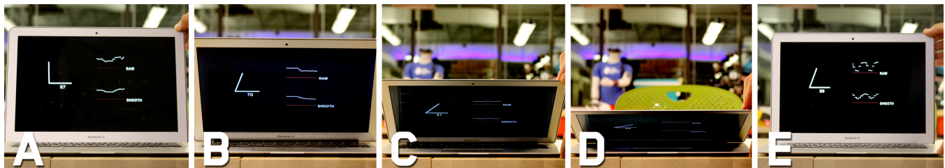
Figure 2. SweepSense can infer continuous laptop lid angle. Here the lid is positioned at 100, 70, 50 and 30° (A-D); SweepSense reports 97, 70, 51 and 30° respectively. Far right (E), a 1Hz “wobble” gesture is performed and visible in the raw signal.

Implementation. For our laptop lid angle application, we emit a continuous 20-40kHz sweep from a 2013 MacBook Air’s 2013 built-in speakers (located where the display